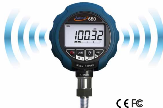
680 with data logging and wireless (optional)